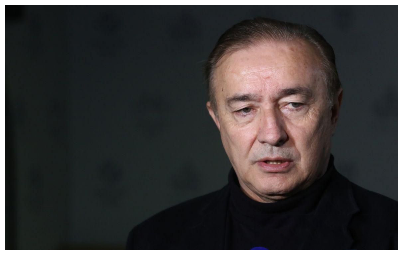
KUKIĆ: THE IMPORTANCE OF BIDEN'S MOVES FOR THE FUTURE OF BIH

If so, in a relatively short period of time BiH could be freed from many of the obstacles hindering its Euro-Atlantic integration