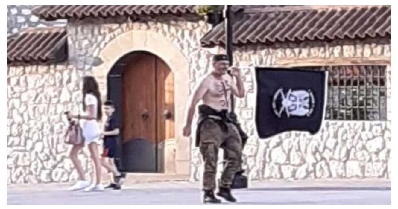
NATIONALISTIC OUTCRY IN PLJEVLJA