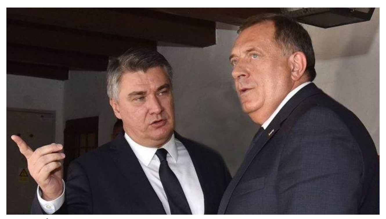
MILANOVIĆ I DODIK: FIRST SOAP AND ONLY THEN PERFUME.