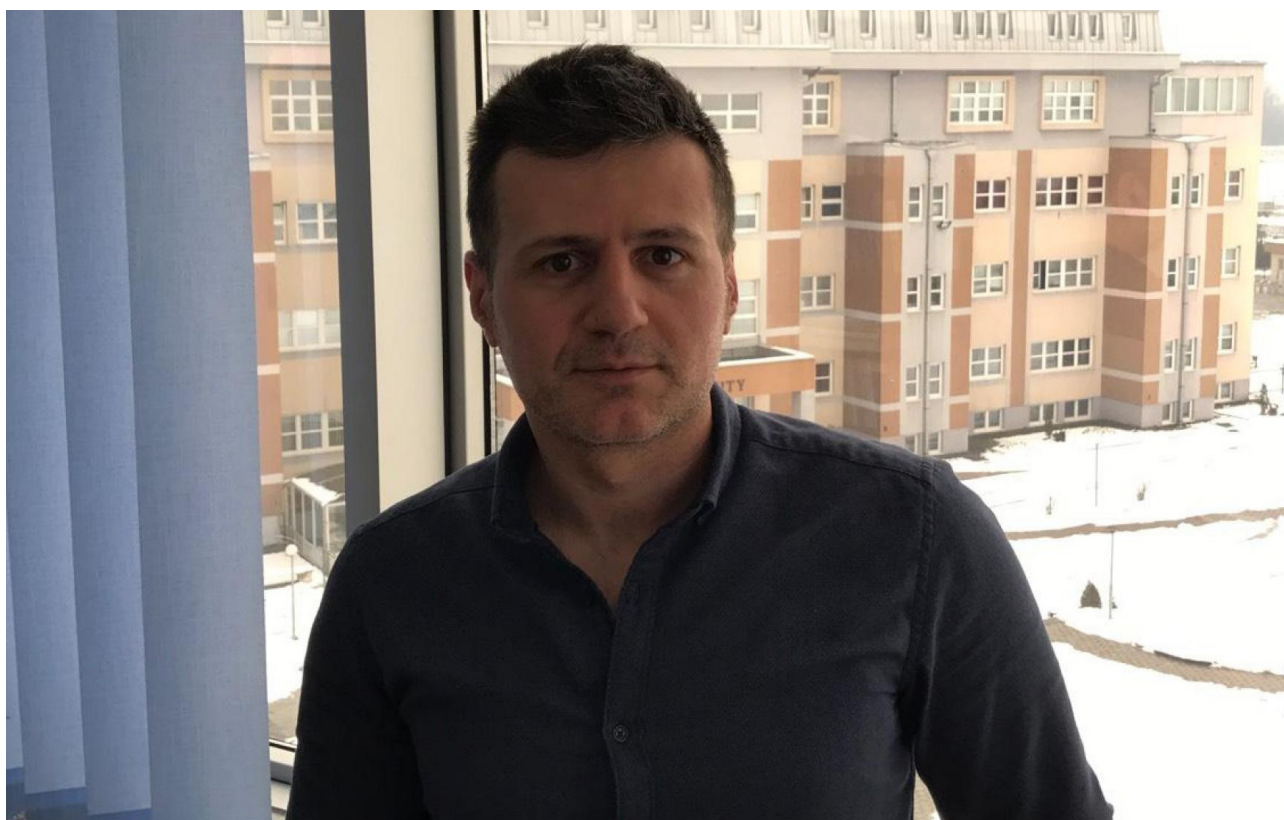
MAKSIĆ: A TURN IN AMERICAN POLITICS WILL SOON BE EVIDENT

Confrontation with political actors that threaten the territorial integrity of Bosnia and Herzegovina, and stronger support to Kosovo's independence are to be expected, says Maksić