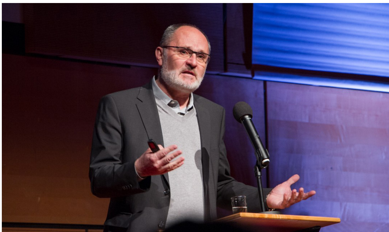
CVRTILA: TERRORISM IS A MODERN THREAT THAT IS IMPOSSIBLE TO ERADICATE

President Macron's speech is an example of how a terrorist act is taken advantage of for the purposes of public mobilization against Islam as religion, says Cvrtila