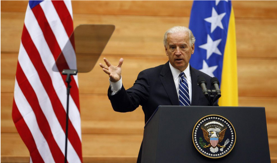
BIDEN AT THE BIH PARLIAMENT IN 2009: WHAT CAN BE EXPECTED?

On November 7, American leading media outlets proclaimed Biden the winner of the US presidential election after he was announced the winner in the crucial state of Pennsylvania. Since then, it has been confirmed that the Electoral College (538 electors) would convene on 14 December. The college will vote and then send their votes to several addresses, including to the address of the current US President.