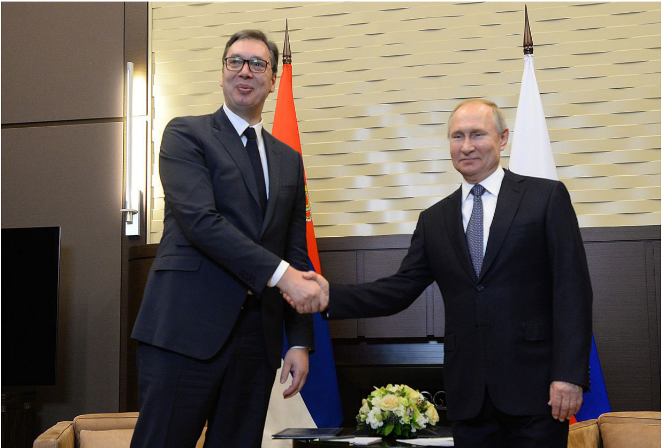
VUČIĆ AND PUTIN: BIDEN ADVOCATES OPPOSITION TO THE SPREAD OF RUSSIAN INFLUENCE

According to him, there is no doubt that the future of relations among Americans largely depends on how Donald Trump will be using this capital.