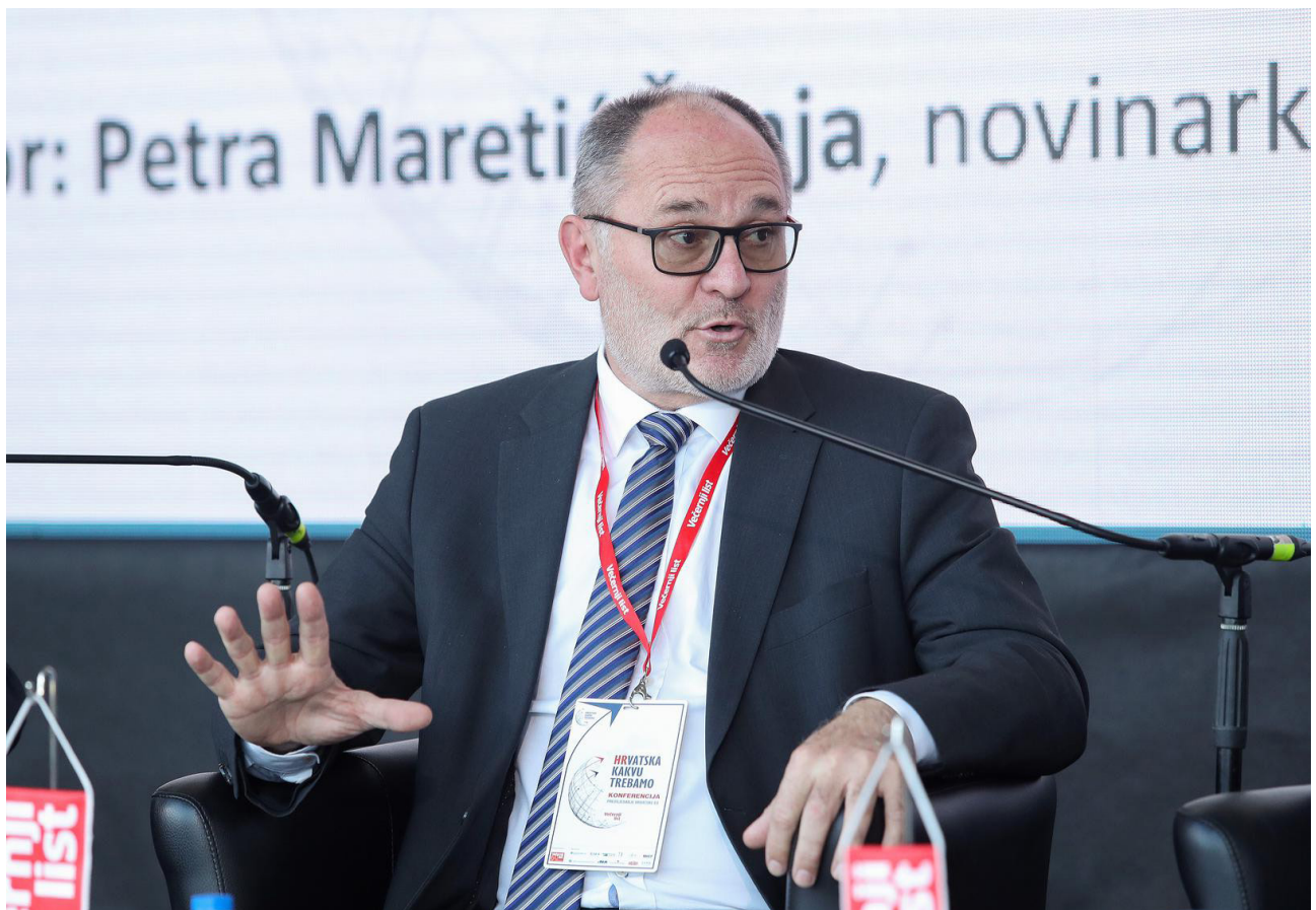
I SEE NO DIFFERENCE BETWEEN FOLLOWERS OF RIGHT-WING POPULISM AND TAKFIR IDEOLOGY

Vlatko Cvrtila: Such an offense has elements of a terrorist act, considering that the information available has given rise to the conclusion that it was a radicalized individual. But it is impossible to identify the motive, therefore it is hard to say whether it was a classic terrorist attack.