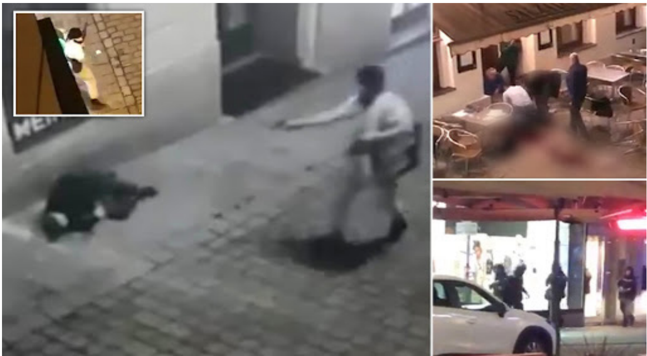
NAPAD U BEČU

It is adolescents who have already embarked on the natural processes of separation and individuation - i.e. the gradual taking of personal responsibility for emotional, behavioural and cognitive functioning, with an increasing level of independence from parents - who mostly engage in such a search. This process is often accompanied by misunderstandings and conflicts within the family, and young people sometimes rely on simplistic but radical narratives when opposing parental authority. Research has shown that the process of ideological radicalization that can lead to extremism is mostly driven by the need to satisfy social urges.