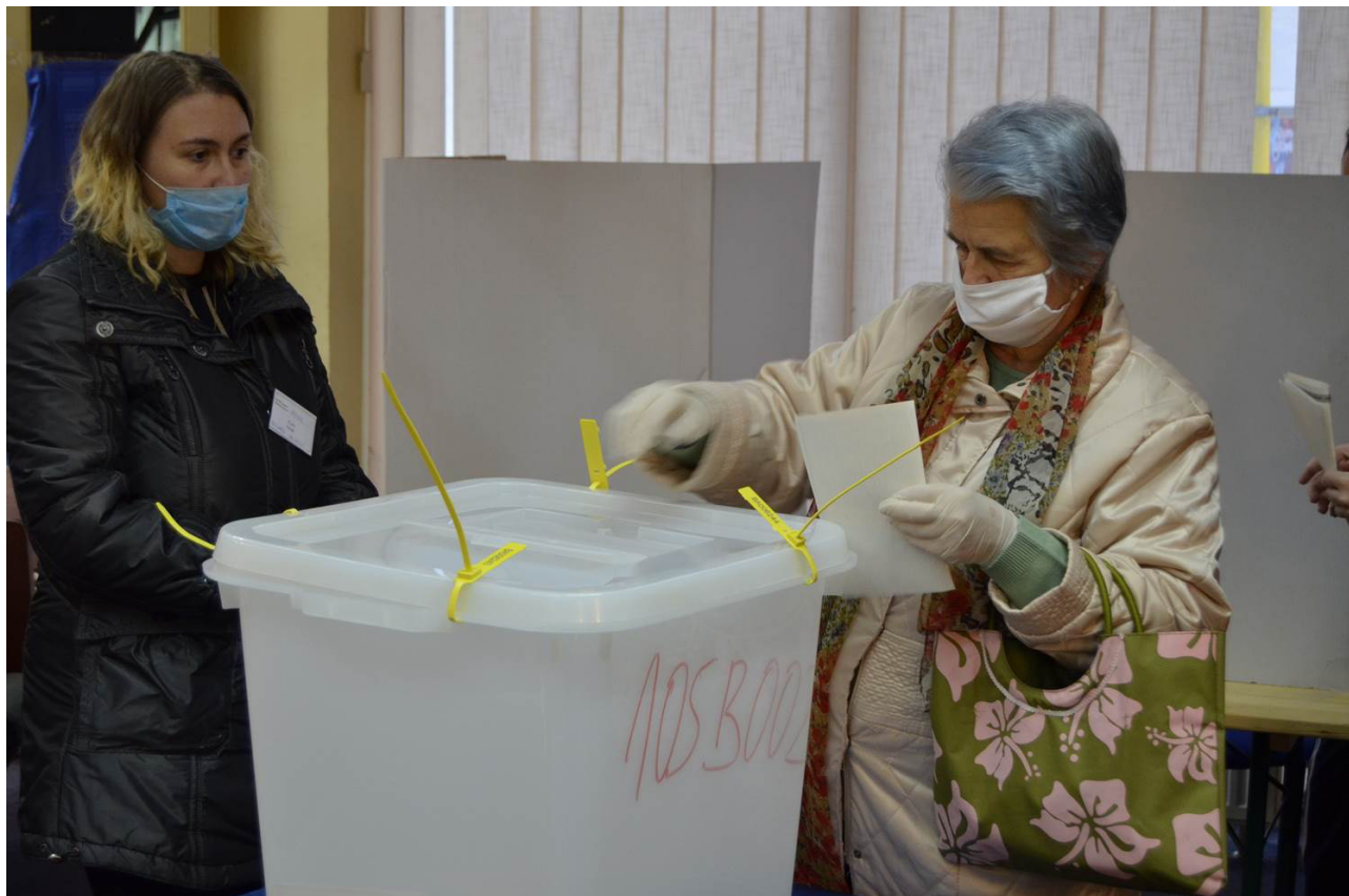
LOCAL ELECTIONS: IS BOSNIA AND HERZEGOVINA AT A TURNING POINT?