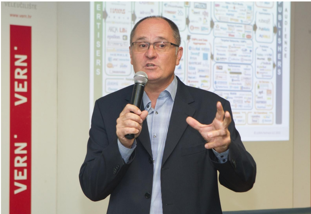
LABELLING AN ENTIRE CULTURE AS A POTENTIALLY THREATENING ACTOR IS OUT OF PLACE